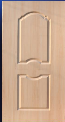
RS - 4