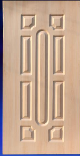
GJ - 7