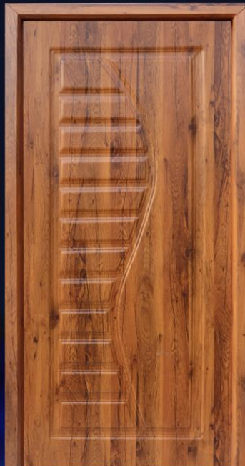
P - 13