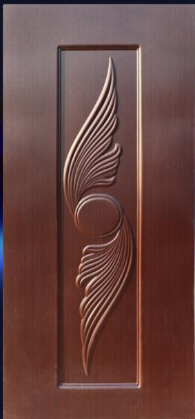
v - 11