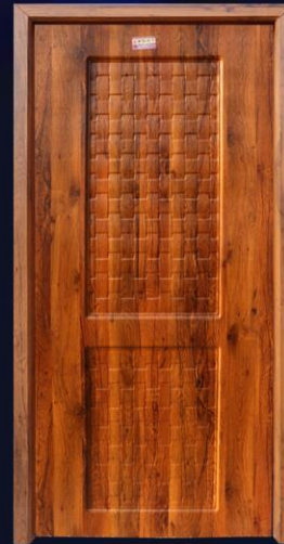
V - 12