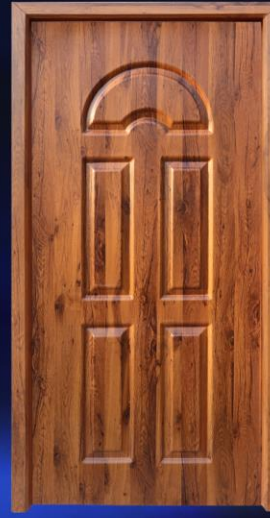
HV - 6/1