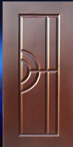
FM - 10