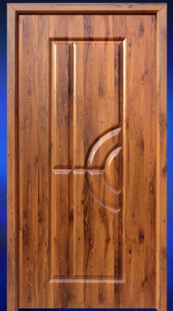
FM - 10/1