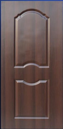
RS - 3