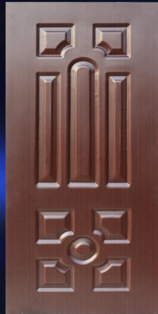
EM - 14