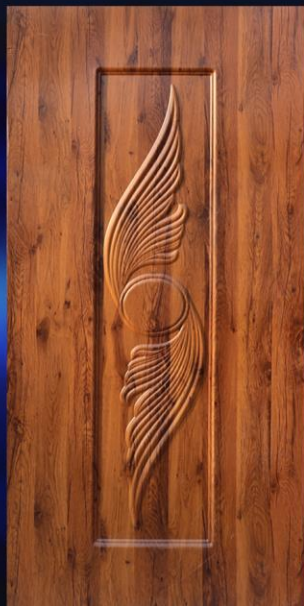
v - 11/1