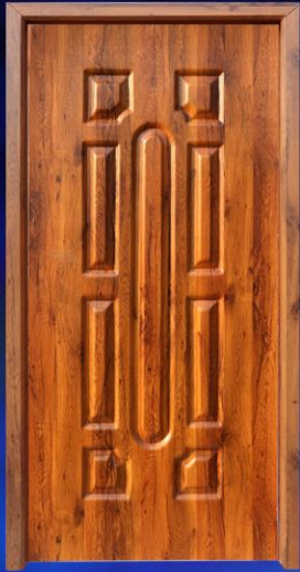
GJ - 8