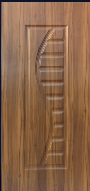
P - 13/1