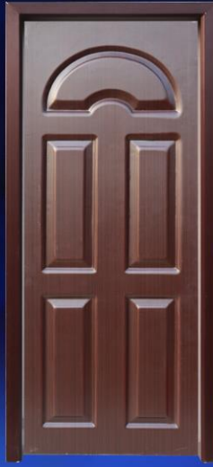
HV - 6