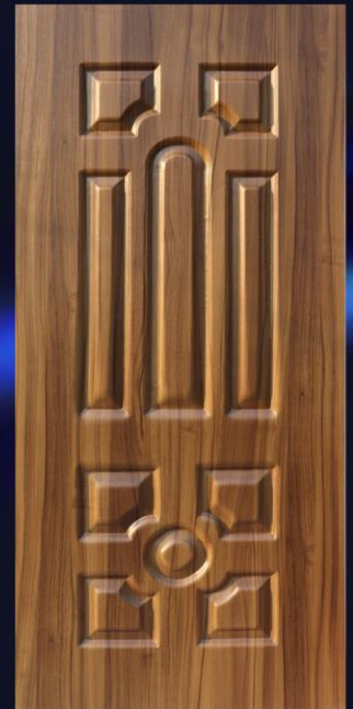
EM - 14/1